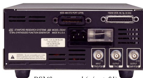
DS340 rear panel (w/ opt. 01)